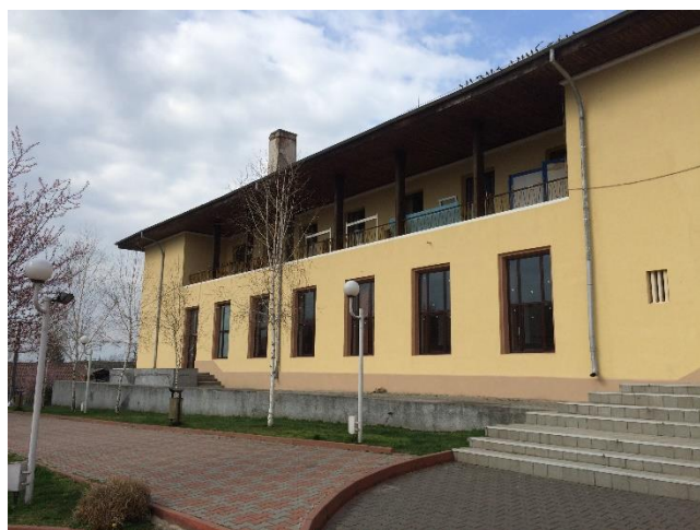
One of the completed renovation projects supported by the programme

Two additional objectives set the stage for more widespread renovation in the future. One was to boost the understanding and knowledge of building professionals on the need to consider the energy performance of the building stock and to increase their skill sets. Evaluation reports show that more than 800 professionals reported greater knowledge and improved skills. In parallel, the project aimed to develop standardised project documentation for the renovation of 50 different apartment types, thereby making it much easier to prepare tenders for diverse projects across administrations in various regions of Romania.