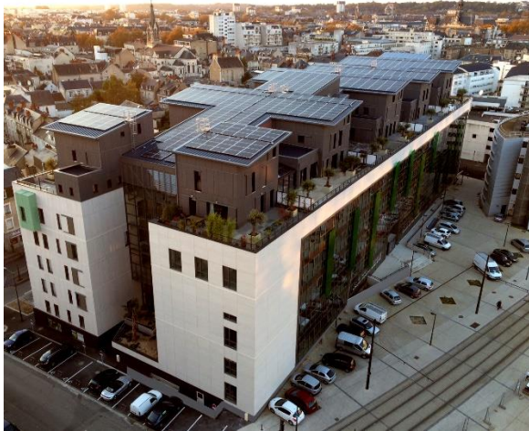
Completed exterior of the Le Nef renovation project

allowed integration of bio-climatic design principles within a high-performing building envelope, in turn linked to advanced and regularly commissioned heating, cooling and energy-generating systems.