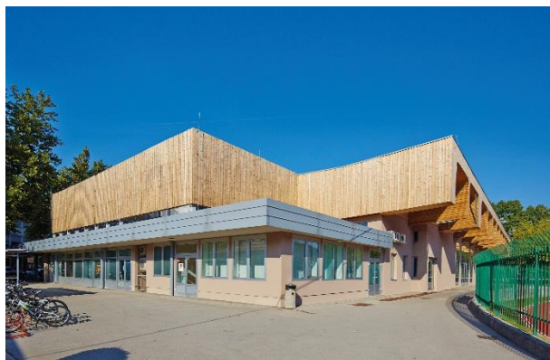
Sports hall renovated as part of the partnership

Since 2017, the partners have renovated 48 public buildings, including schools, libraries, cultural institutions, sports centres, etc. Twenty-five of the projects were done to standards qualifying for deep energy renovation while actions possible on some buildings were constrained by their heritage status. Even so, the initiative achieved an average energy reduction of 70% to 85% . The City's energy bills have been slashed by €1m annually while building occupants benefit from greater comfort. This innovative approach won the PPP an award from the EU-funded project known as GuarantEE .