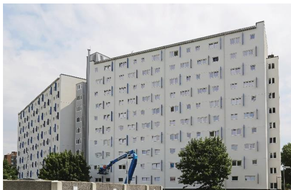
Completed exterior of Wilmcote House

Energy efficiency was not a high priority for UK social housing in the 1960s, including for Wilmcote House a complex of three connected apartment blocks comprising 107 homes . Portsmouth is the most densely populated city in the UK outside of London and the Somerstown area (in which Wilmcote House is situated) is one of the country’s most deprived zones. For decades, residents experienced high heating bills (most being in severe energy poverty) and had to cope with mould, damp and condensation that adversely affected their health.