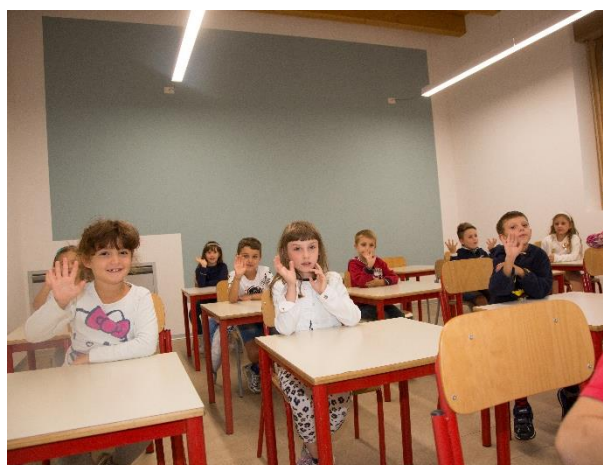
Students studying in their newly renovated school

Motivated by the need to address all of these issues, local government took a holistic approach to building upgrades that put high priority on students, paying special attention to their thermal, visual, indoor-air and acoustic comfort. Improving the building envelope reduced heat loss and provided a more effective sound barrier, while optimising daylight reduces the need for artificial light. Installation of purifying products, together with an ionisation unit in the ventilation system, have significantly improved indoor air quality. In short, the school has been completely transformed to achieve an exceptional indoor environment for learning combined with an exceptional level of energy performance and safety.