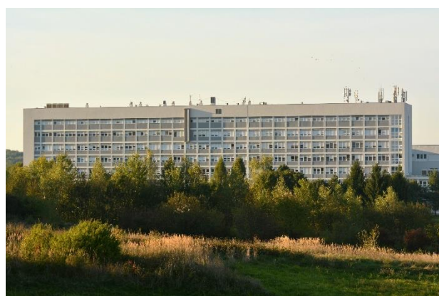
Completed exterior of the Karlovac Hospital, Croatia

Although energy savings ( 54% ) are lower than in some projects highlighted, the works delivered other economic benefits in terms of reducing the average length of stay for patients and boosting the health and well-being of staff. Considered together, these benefits clearly prove that energy performance contracting is a viable model for high occupancy, public buildings.