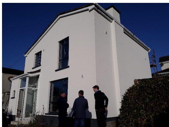
A completed renovation of a home in Ireland, renovated with the support of the pilot scheme

Between 2017 and July 2019, the programme was carried out on 261 homes . The Irish government estimates that criteria by which homes could qualify for grants under the pilot applies to around 1 million homes in the country. As such, the potential energy savings and emissions reduction is enormous.